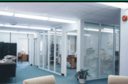
Demountable Office Partitions