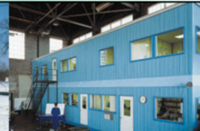
Two Storey Facilities