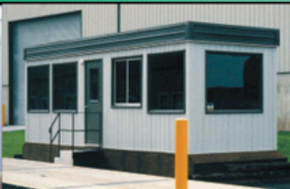
Weigh Scale Office